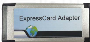
Express card to the converted port adaptor x1