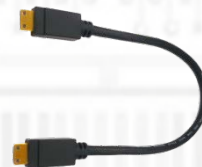
PCI-E Male to Male cable 30cm x1

Option: PCI-E Male to Male cable 100cm x1